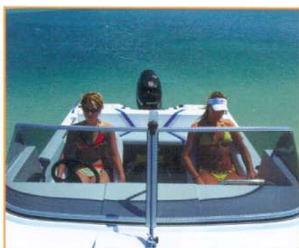
Two Piece Screen