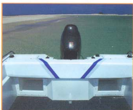
50 Litre Rear Storage Bins