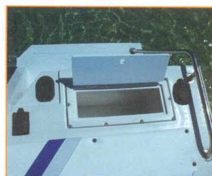
Rear Bait Boxes